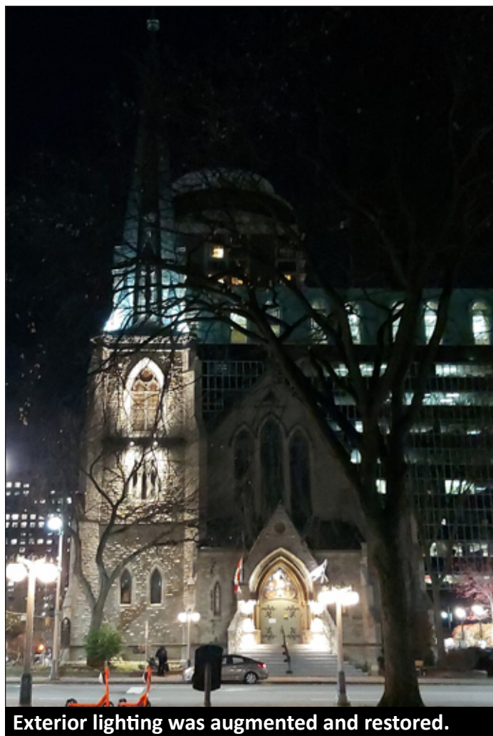
Exterior lighting was augmented and restored.

Temporal is divided into property, security, long-term maintenance, emergency response, and financial officer. Members typically devote part of their efforts to working on one or more of these areas. To note, with the upcoming 200th anniversary of St. Andrew's, we welcome new members interested in supporting any events.