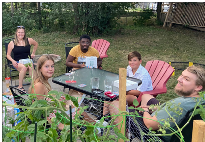
The youth group met regularly – indoors and out!

Monthly Zoom events included Kids’ Church. Wednesday Evening Studies continued, and we are grateful for all who attended and stepped up to lead. Lent and Advent devotionals were lovingly packaged