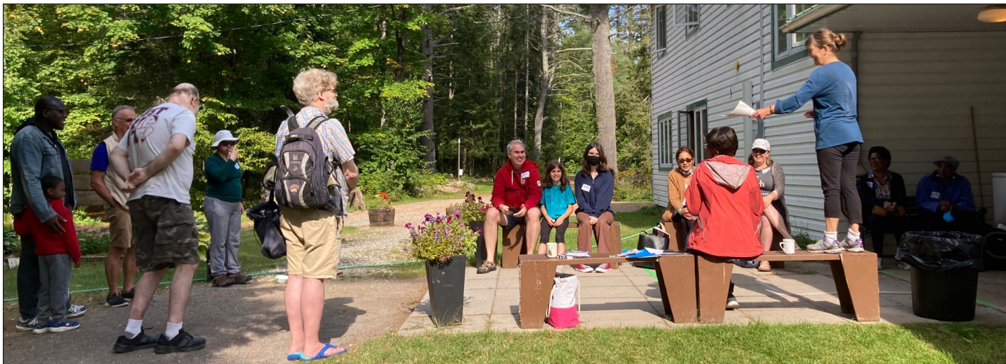
Some 30 St. Andreans shared a September day at the Gracefield Christian Camp and Retreat Centre.

The committees that work under the direction of the Kirk Session of St. Andrew's organize and implement the stewardship and discipleship initiatives of the church. Each committee has a different mandate, and the projects upon which they focus vary accordingly. On the following pages, you will find reports provided by the committees. These reports offer a summary of their work in 2021. You will also find lists of the committee members. If you would like to know more about a committee's work, please contact the committee's convener.