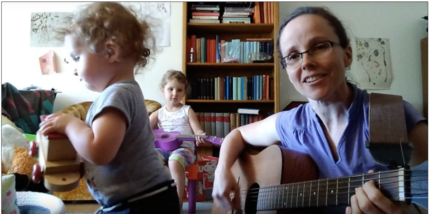
More than 30 families contributed content videos, including music and songs, for the virtual VBS.