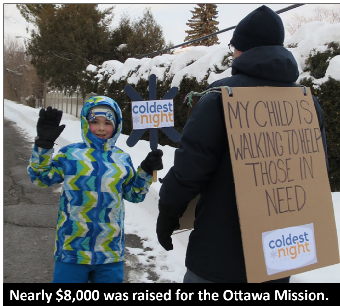
Nearly $8,000 was raised for the Ottawa Mission.