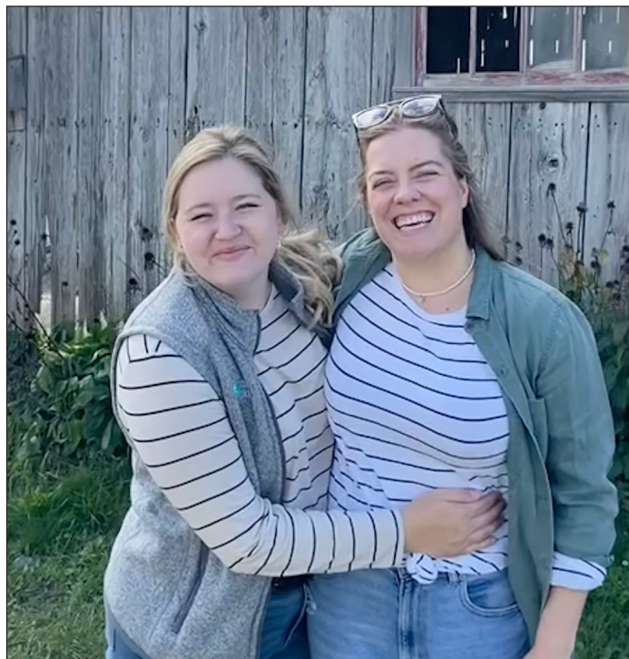
Sharing joy in an uncertain year.