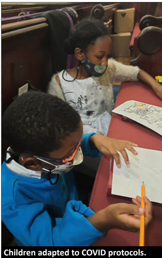
Children adapted to COVID protocols.