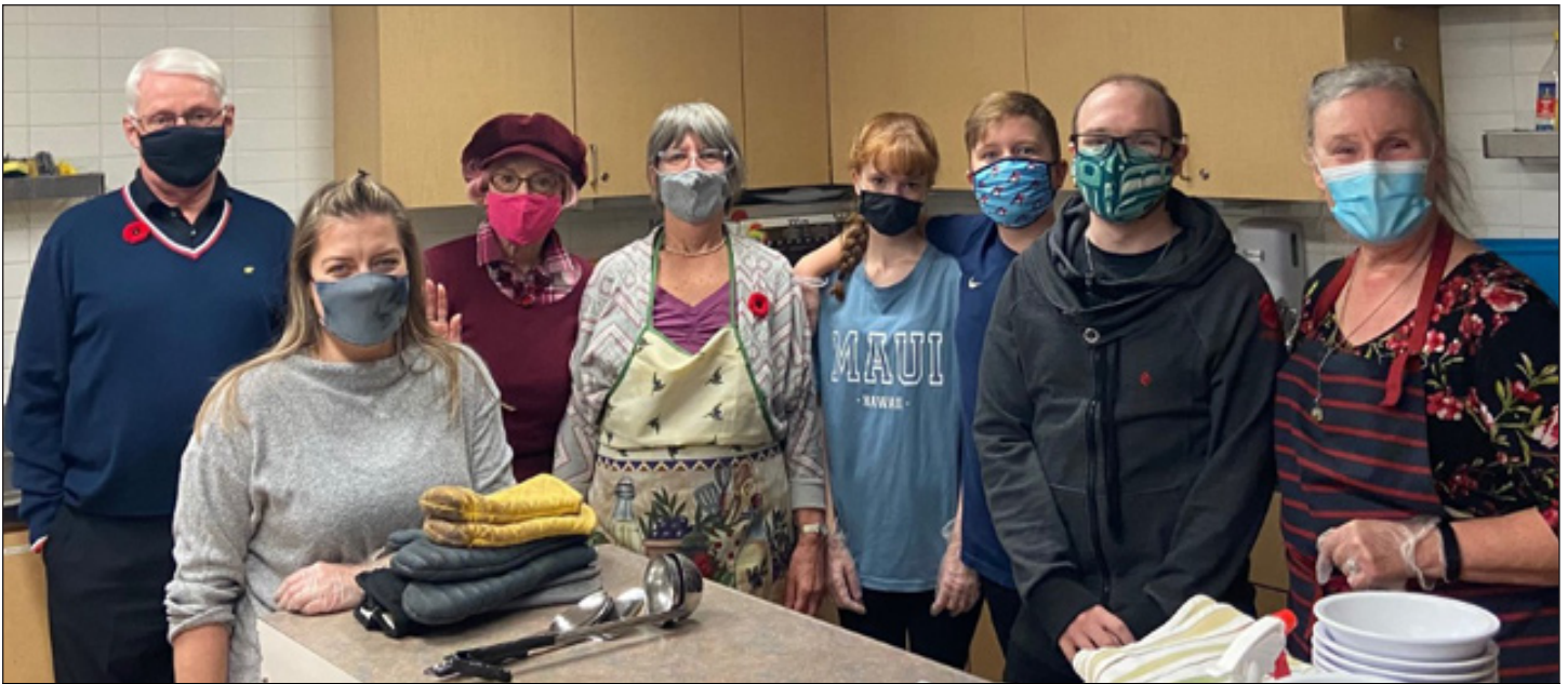
As part of the Open Table, St. Andrew's hosted the community meal in October at Centre 454.