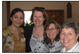
WOMEN'S RETREAT PAGE 6