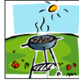
C.E. SUMMER ACTIVITIES PAGE 11