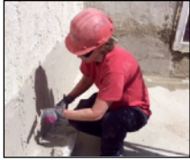
HABITAT FOR HUMANITY PAGE 5